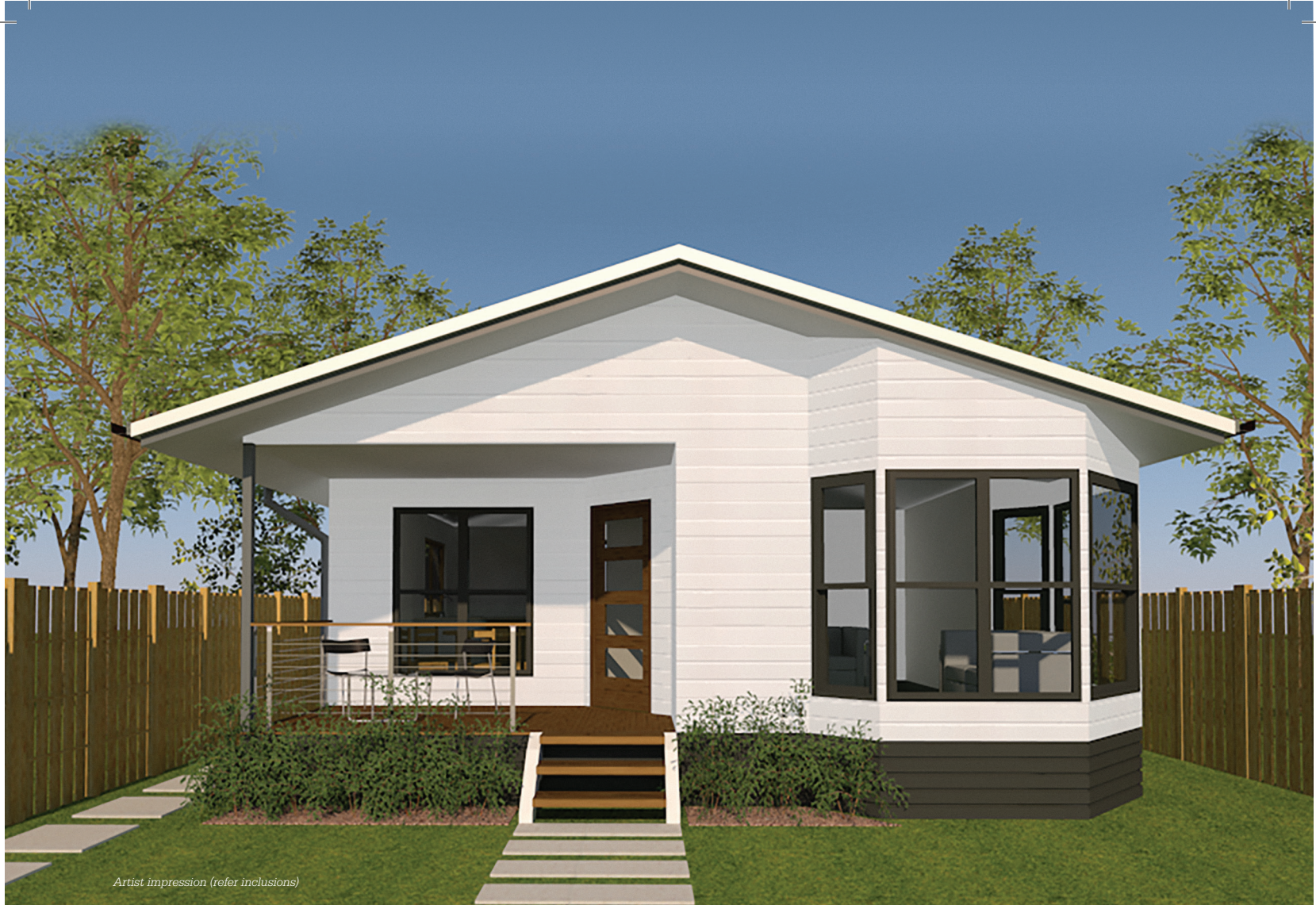
Artist impression (refer inclusions)